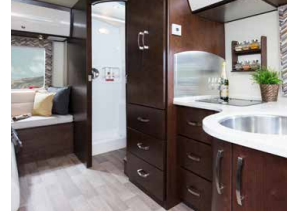
Espresso Brown 50th Anniversary Décor Package