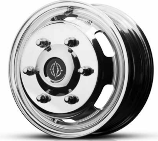
Alcoa Dura-Bright® Aluminum Wheels Optional - All 6 Wheels