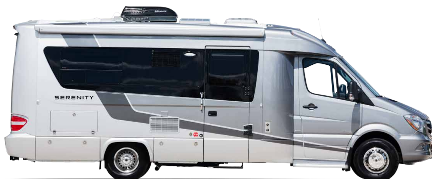
Silver Serenity Shown Above