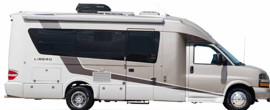
White Suede Libero Shown Above