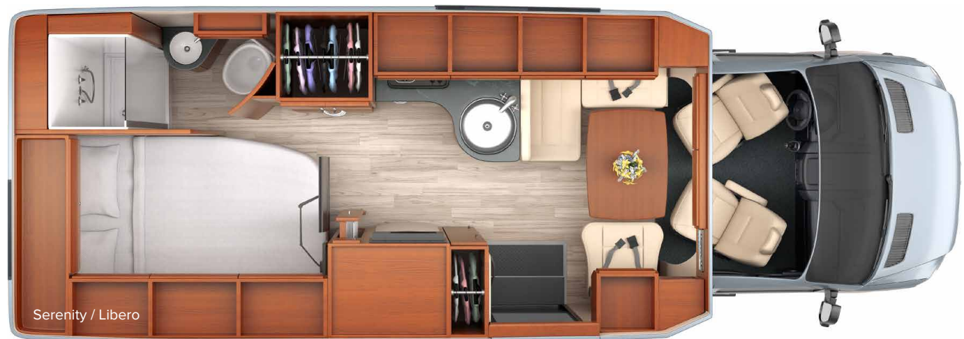
Serenity / Libero