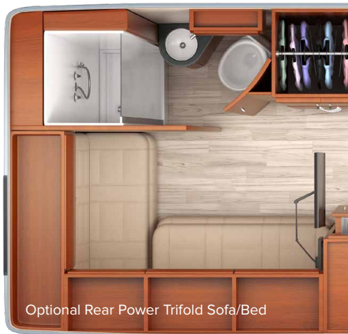
Optional Rear Power Trifold Sofa/Bed