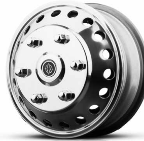
Steel Wheels Standard - With Wheel Simulators