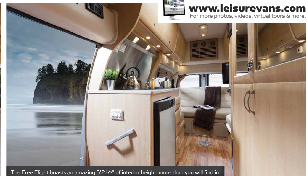
The Free Flight boasts an amazing 6'2 1/2" of interior height, more than you will find i most Class B motorhomes under 21'.

The Free Flight is engulfed in great looking cabinetry surrounded by brand name appliances,